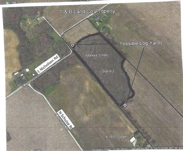
Stand #2 16.5 Acres