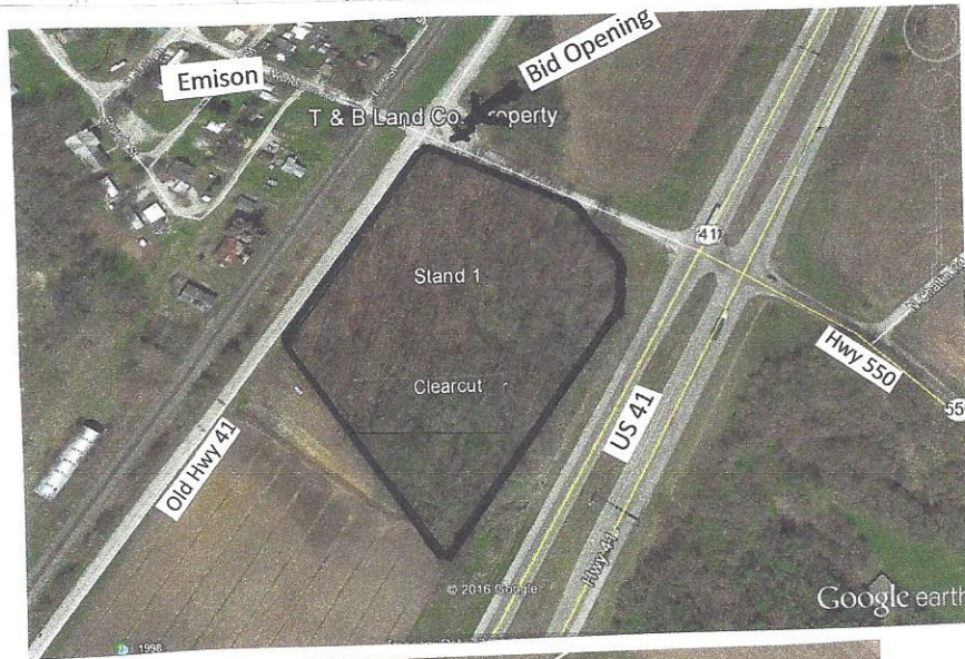
Stand #1 6 Acres