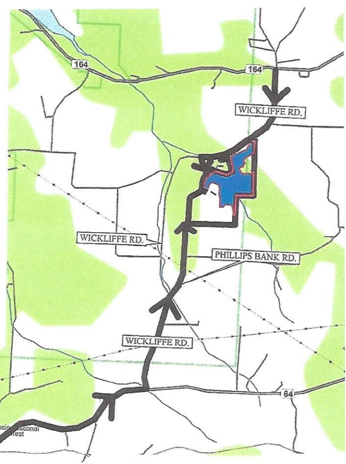
BROSMER TIMBER SALE MAP